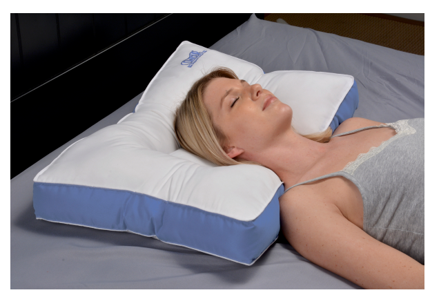
Helps to soothe stiff necks, relieve shoulder aches and comfort the upper body.