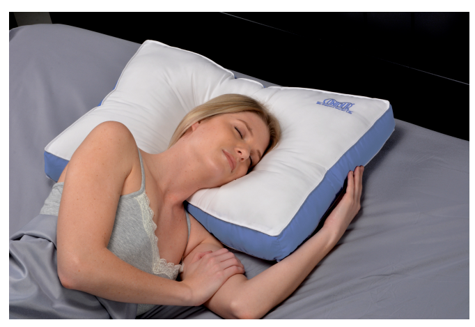
Encourages your neck and shoulder muscles to relax to align your neck and spine.